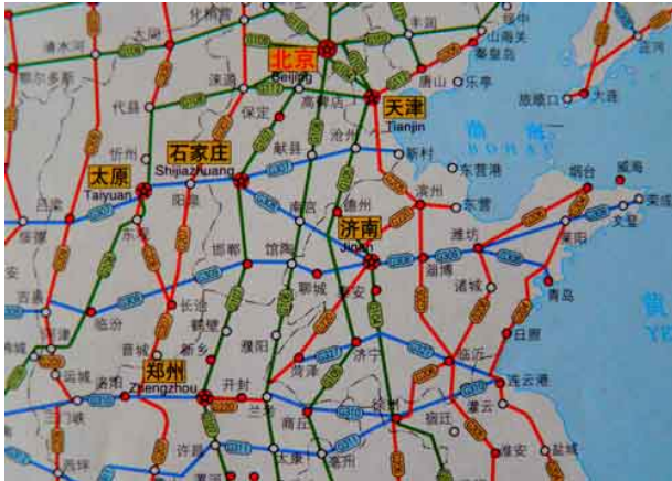
National Highway structure in and around Shandong Province: